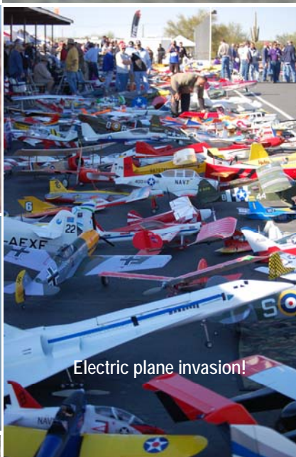
Electric plane invasion!