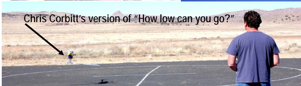
Chris Corbitt's version of "How low can you go?"