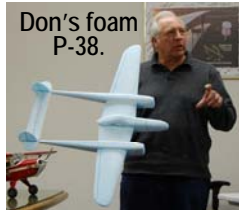
Don's foam P-38.