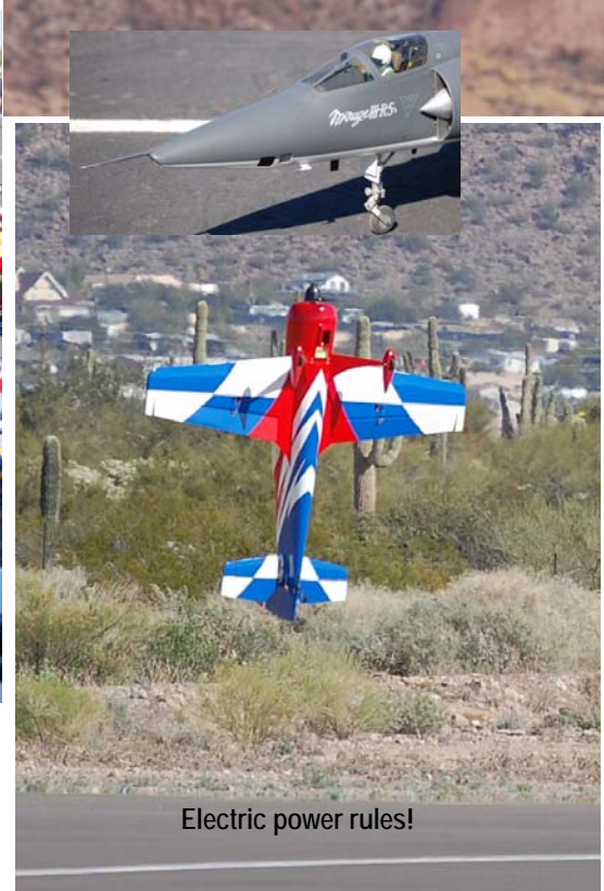
Electric power rules!