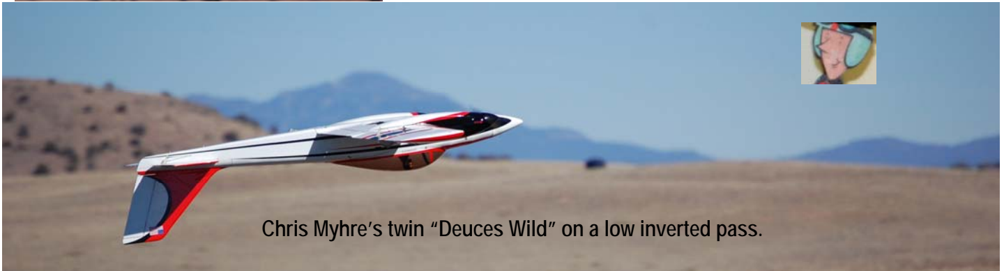
Chris Myhre's twin "Deuces Wild" on a low inverted pass.