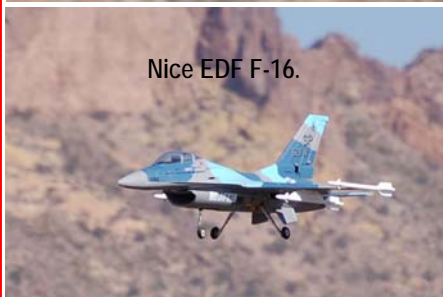
Nice EDF F-16.