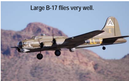
Large B-17 flies very well.