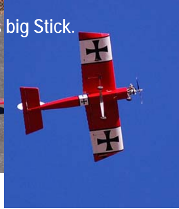
A Ray Stone creation of many plane parts, cool Ray.