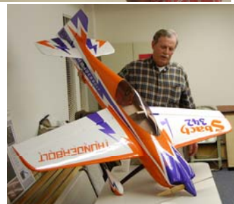
Graham's big S Bach.