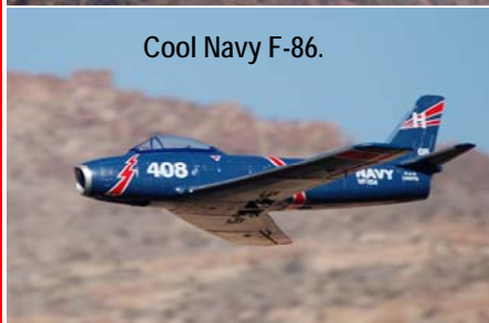
Cool Navy F-86.

Lots of vendors and displays with constant aircraft in the sky over the Superstition Mountains.