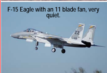
F-15 Eagle with an 11 blade fan, very quiet.