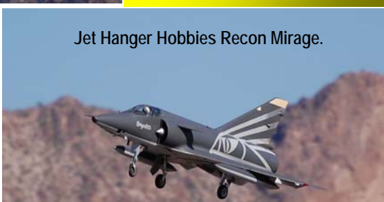
Jet Hanger Hobbies Recon Mirage.