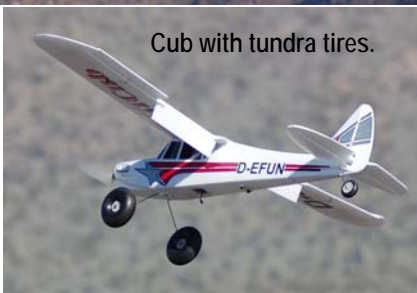
Cub with tundra tires.