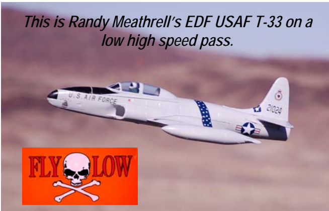
This is Randy Meathrell's EDF USAF T-33 on a low high speed pass.