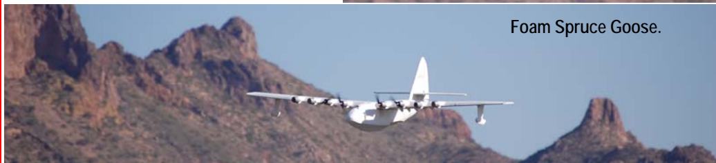
Foam Spruce Goose.