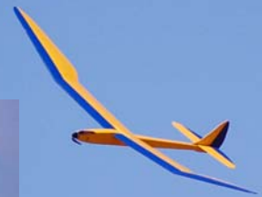
Yak on a long landing approach.