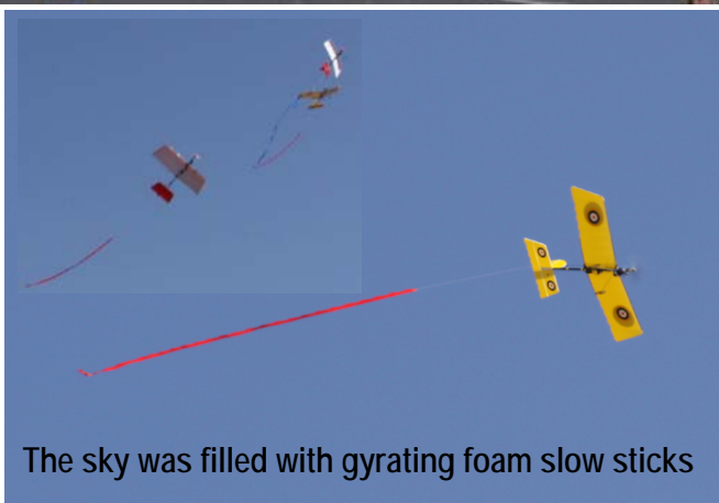
Flat foam combat ships competed too.