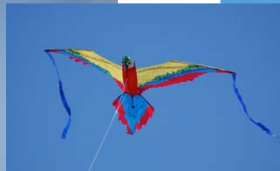
Cinnamon Bandy flew her parrot kite when the usual cross wind came up and everyone packed away their planes.