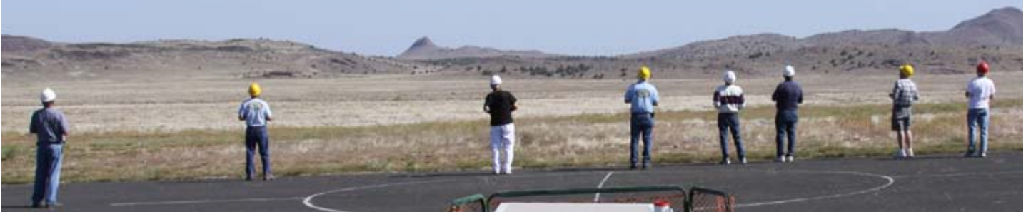
Eight concentrating pilots trying to cut opponents streamers.