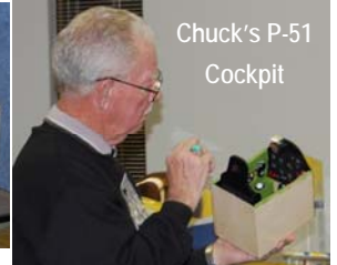
Chuck's P-51 Cockpit