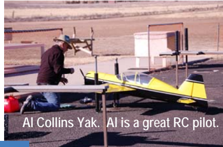
Al Collins Yak. Al is a great RC pilot.