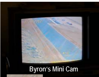
Byron's Mini Cam