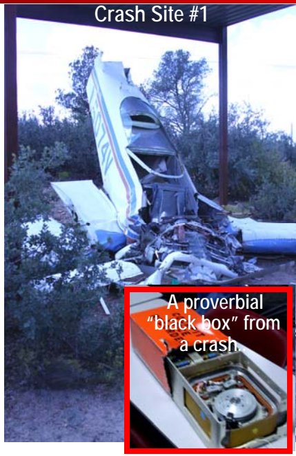
Crash Site #1