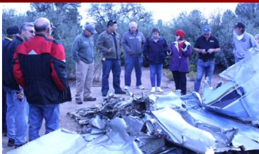
Members viewing various sites.