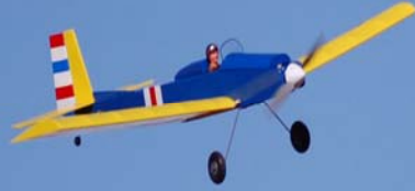
Randy Meathrell's scratch built Pronto: Featured in September 2012 Issue of Model Airplane News.