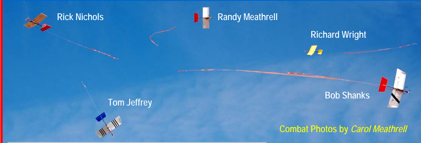
Combat