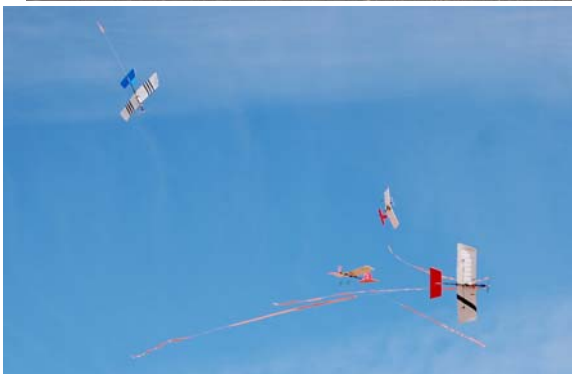
The sky was full of angry combat bees!

To end a perfect day the club had a great pot luck dinner at 5 pm Saturday. Four members flew T-28's in a mock pylon race just at dusk (see cover photo). Good food, good flying, and good friends, a great club.