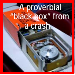
A proverbial "black box" from a crash

On October 12 members were treated to a great tour of ERAU's outdoor crash laboratory located on approximately 8 acres behind the Robertson Aviation Safety Center (RASC). This is the only facility of its kind at a university in the US for safety and crash analysis.