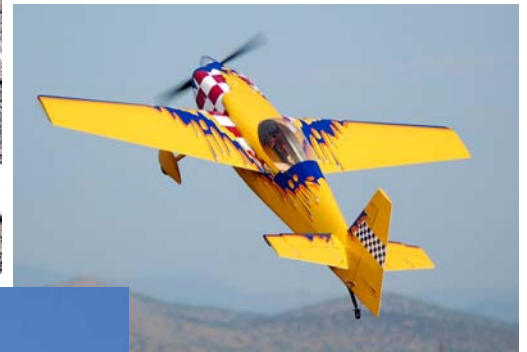
Your editor's stick powered by a Magnum .80. The Stick used to belong to Bob Noulin.