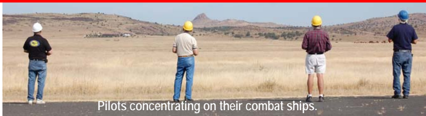
Pilots concentrating on their combat ships.